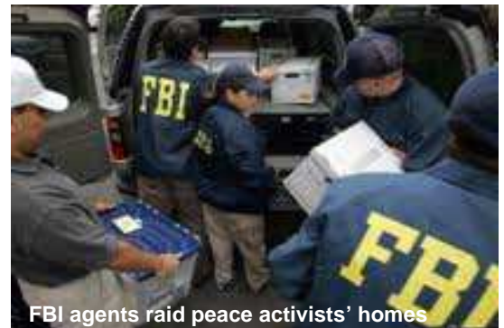
FBI agents raid peace activists' homes

This is a critical opportunity for all supporters of civil liberties and the anti-war movement to come out to demand an end to FBI and grand jury repression of local activists! Attorney General Holder can call this off and he's coming to us! He will be speaking at a conference and receiving an award. Help us take this opportunity to publicize his record!